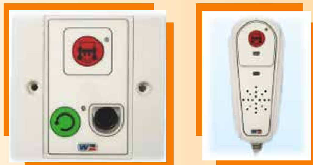
Patient Panel & Hand Unit

Main Supporting System will be patient panel, hand unit, emergency panel, reset panel, overdoor indicator (Tri-Color) and pull cord system