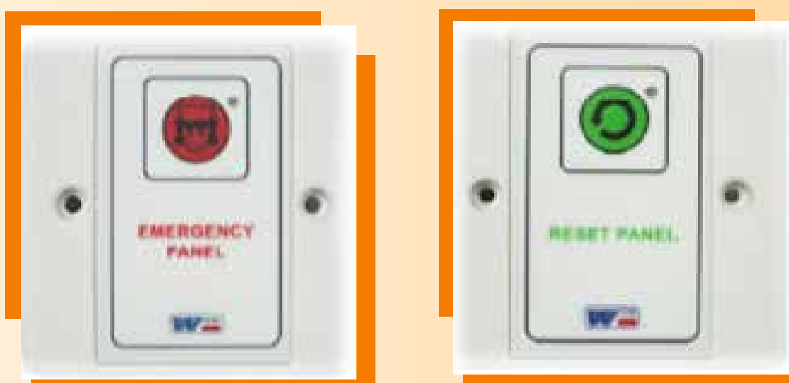
Emergency Panel & Reset Panel