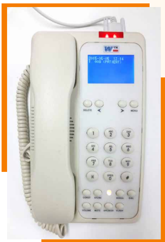
Model WT07001 Nurse Console

It is an important communication link between patients and nursing staff and being designed to meet various kind of visual and tone signal needed for patient call. It provides a two-way nurse to patient speech for instant communication between nurse and patient or other staff.