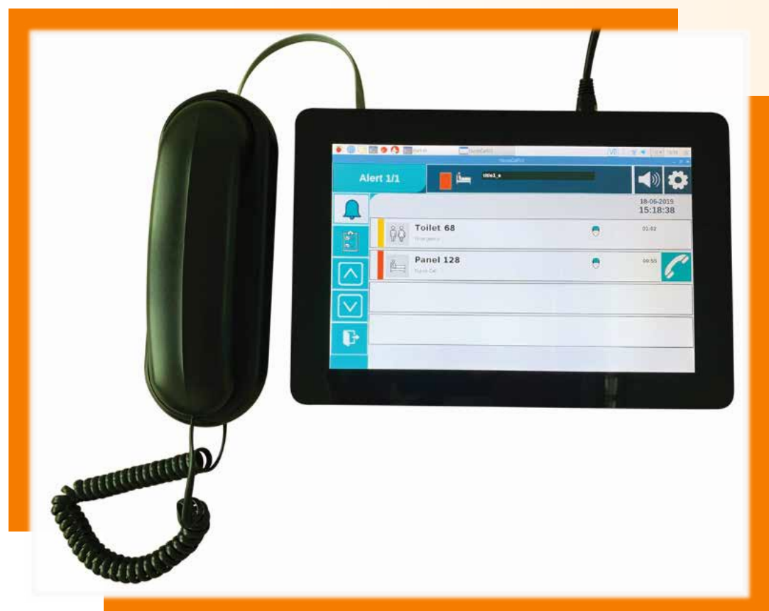
Model WT07001L Nurse Console LCD Touchscreen

Advanced model with LCD touchscreen monitor system or with conventional dial pad system.